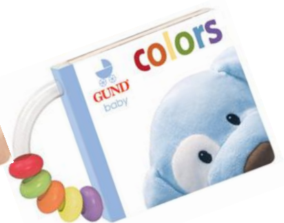
Item #059176 UPC #028399591763