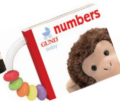
Item #059175 UPC #028399591756