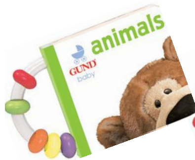
Item #059174 UPC #028399591749